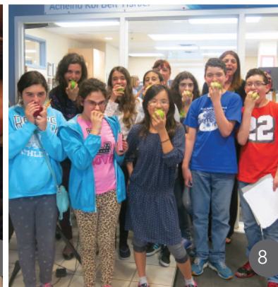
1. DONATING MISHLOACH MANOT PACKAGES FOR PURIM, CEDARVALE | 2. SPRING ART IN NURSERY, POSLUNS | 3. SNUGGLE UP AND READ, CEDARVALE | 4. DAVENING TOGETHER, KAMIN | 5. GRADE 7 SHABBATON AT CAMP GEORGE, DANILACK | 6. LEGO PORTRAITS OF JEWISH HEROES, DANILACK | 7. CARING FOR LITTLE CRITTERS, POSLUNS | 8. GREEN APPLE CRUNCH FOR ECO DAY, DANILACK |