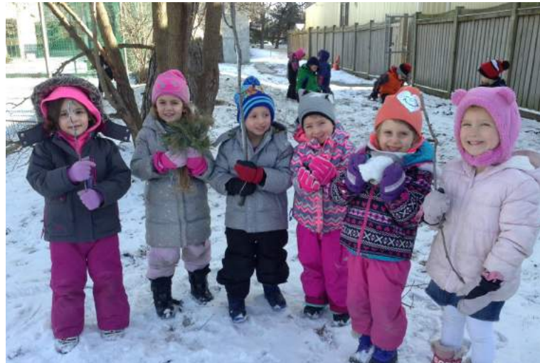
JK Outdoor Learning Program Magical Forest