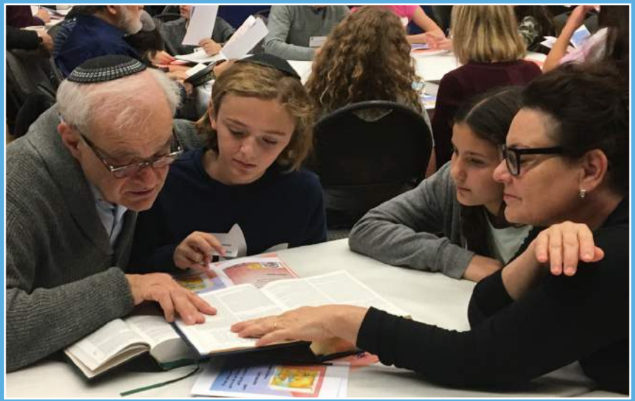
Havruta Learning (Grade 7 Grandparents' Day, Danilack)