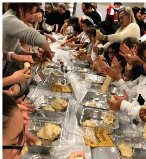
School wide Challah Bake in honour of the Shabbat Project