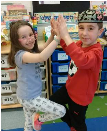
Grade 1 yoga mindfulness