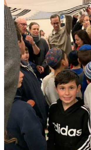
Rosh Chodesh birthday bunch