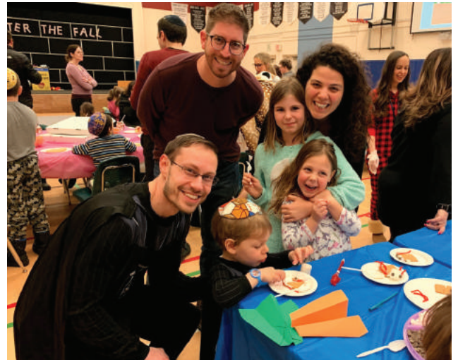
Snuggle up and Read Program for Bet Hageded