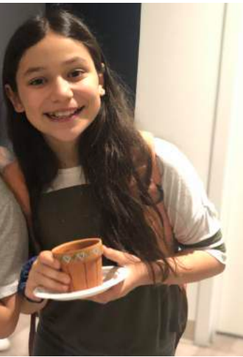
ng creative planters.