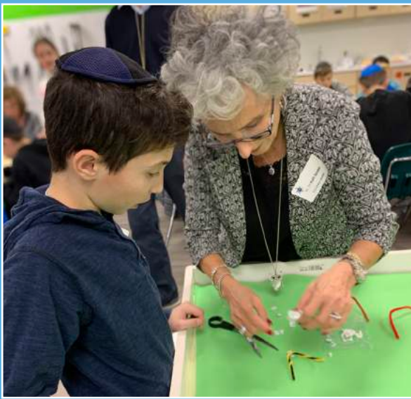
Designing robots in the Makerspace (Grade 7 Grandparents' Day, Danilack)