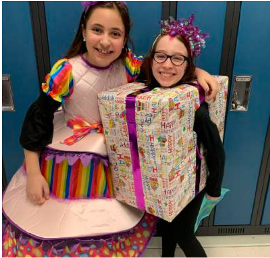
Dressed up for Purim celebrations at Danilack.