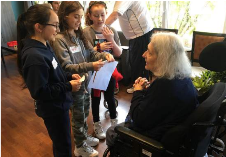
Grade 5 Mitzvah Crew visits One Kenton Place