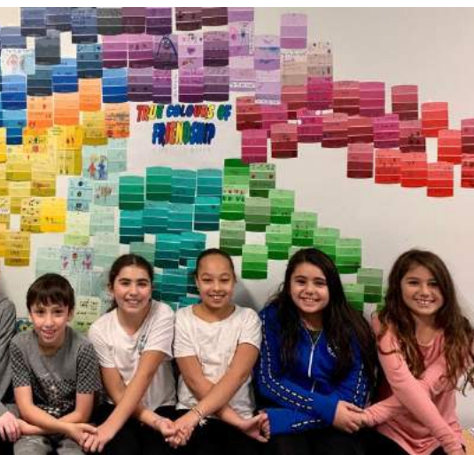
Wide Buddy Day