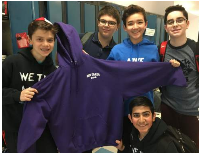
Grade 8s wear their grad gear proudly