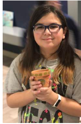
Celebrating Tu B'Shvat by making