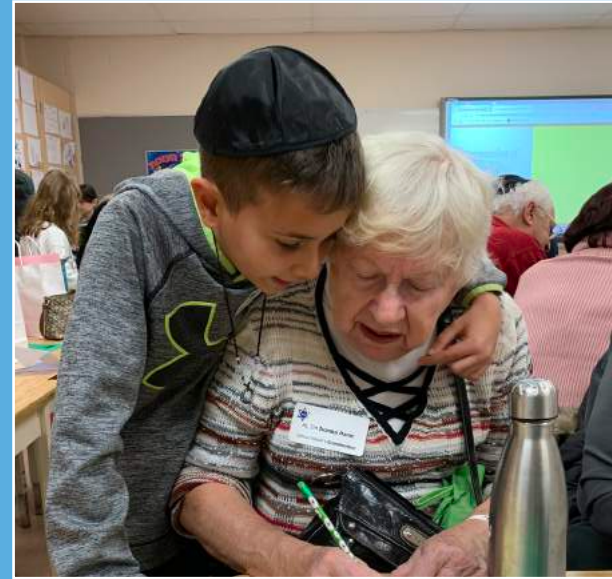
Literacy learning (Grade 4 Grandparents' Day, Kamin)