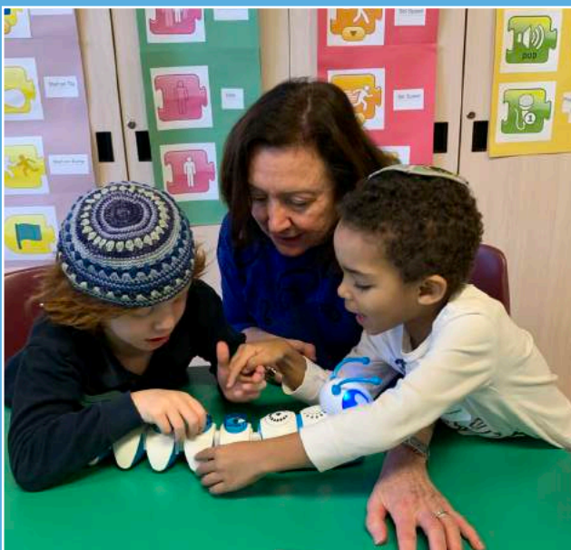
Coding in the Design Studio (SK Grandparents' Day, Posluns)