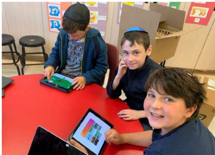
Virtual Reality coding Grade 5