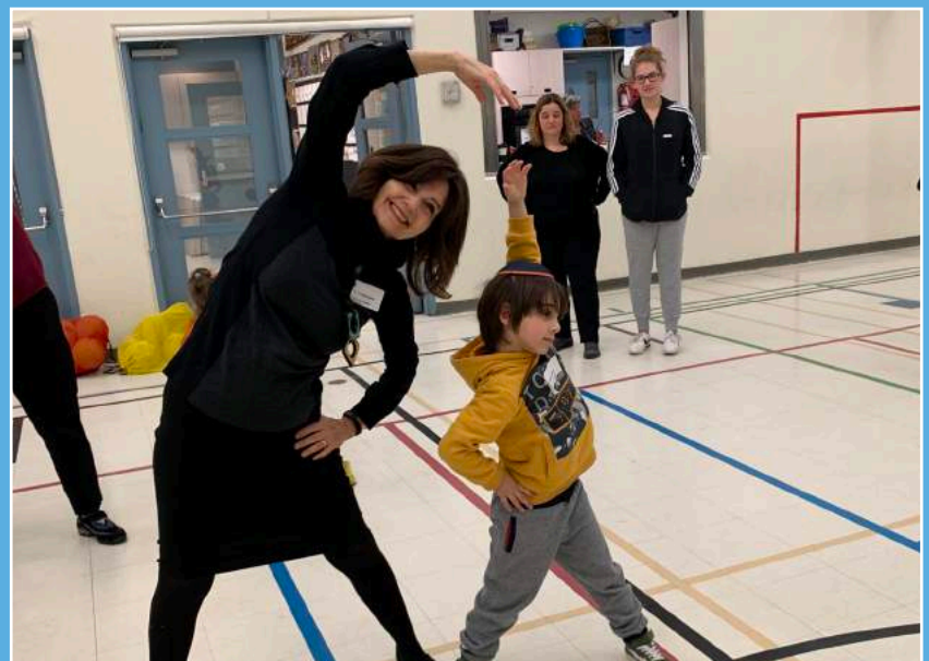
Gym class (SK Grandparents' Day, Posluns)