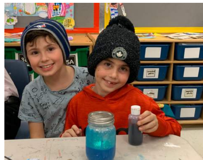
Brothers at STEAM night