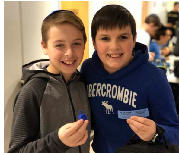
Student council Spirit Day in support of relief efforts for Australia's Wildfires