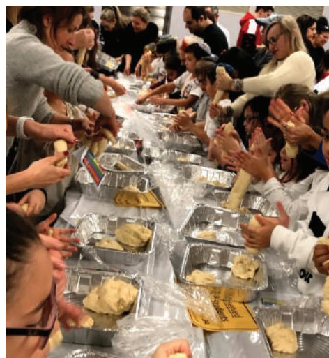
School wide Challah Bake in honour of the Shabbat Project