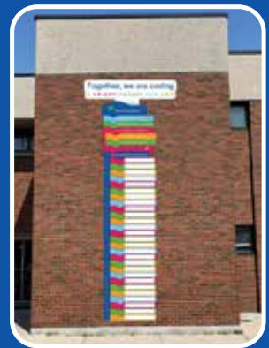
Hurwich Education Centre