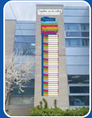
Posluns Education Centre