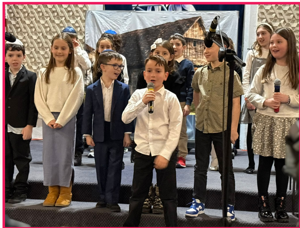
Enhanced AV equipment to support better quality experiences for our audience at milestone events.