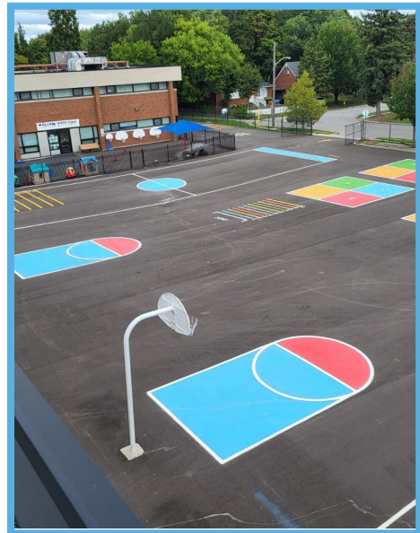
Fresh asphalt and brand-new schoolyard games painted in AHS colours at Hurwich.