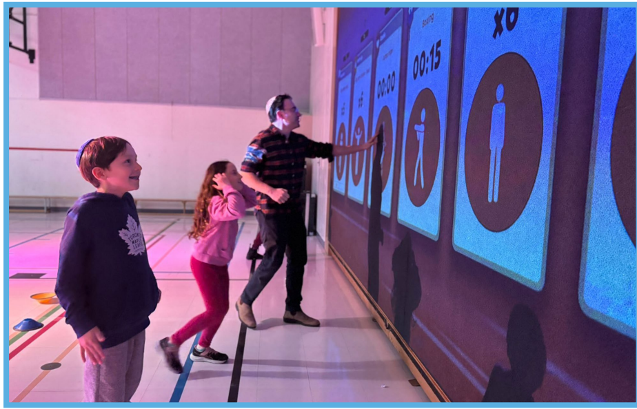
Lu Move interactive equipment installed in Posluns Gym to enhance assemblies and programming.