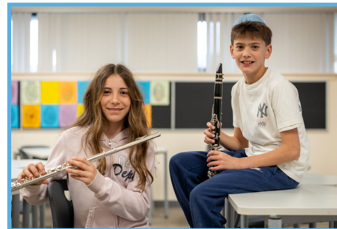
Musical Instrument Expansion including flutes, saxophones, trumpets, and trombones, enabling us to build and expand a thriving Middle School Band program and increase student access to instrumental music.