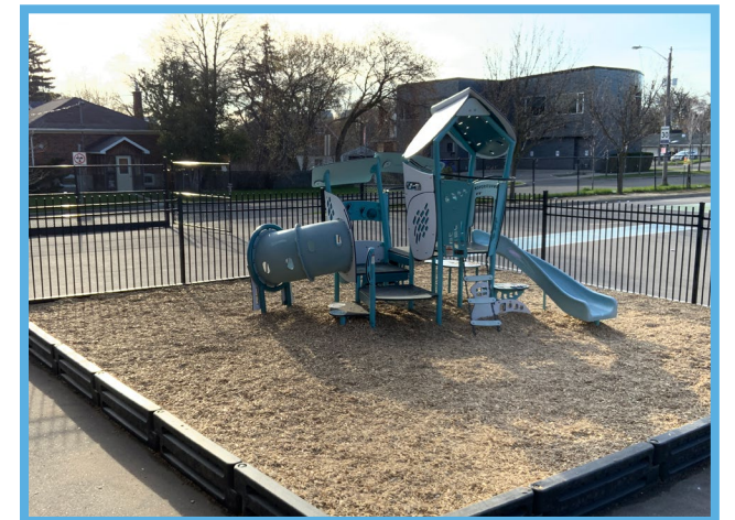
New play structure installed in the Kamin Bet Hayered schoolyard.